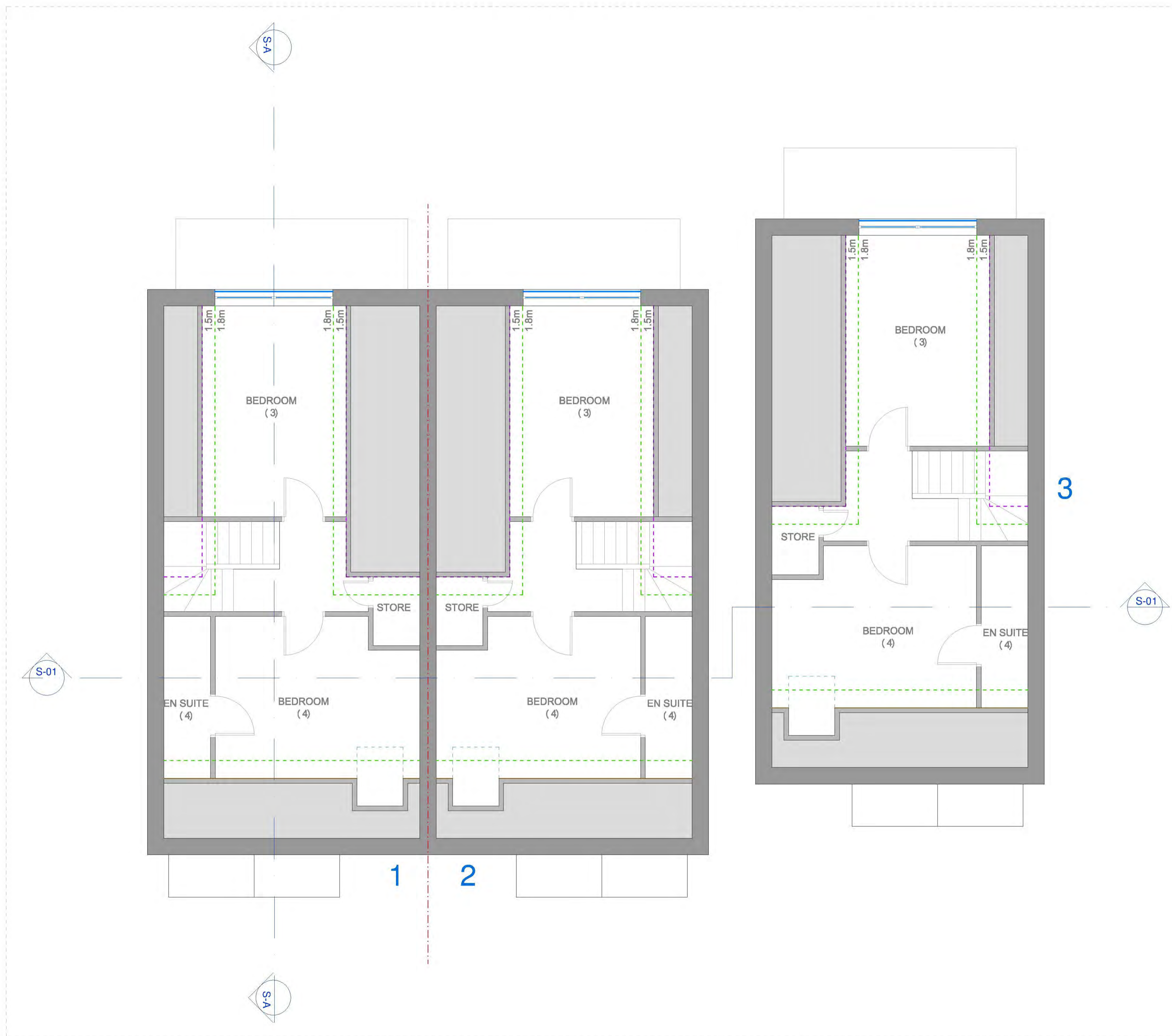
12 Proposed Second Floor Plan GA Internal Floor Area 1 = 40sqm Internal Floor Area 2 = 40sqm Internal Floor Area 3 = 40sqm

BUILDER INFORMATION: DO NOT BUILD FROM ANY DRAWINGS PACKAGES THAT DO NOT SAY: BUILDING CONTROL APPROVED OR IN CONSTRUCTION PACKAGES. IT IS THE RESPONSIBILITY OF THE BUILDER TO CONTACT THE ARCHITECT TO REQUEST CONFIRM THE RIGHT DRAWING PACKAGE IS ON SITE. PLEASE BE ADVISED THAT ALL DRAWING PACKAGES WILL ALSO HAVE STRUCTURAL ENGINEERING WORKS ATTACHED. DO NOT BUILD WITHOUT ALL PAPERWORK. THE CONTRACTOR IS TO ALLOW WITHIN THEIR PRICE FOR ALL ITEMS NOT LISTED BUT THAT WILL BE REQUIRED TO COMPLETE THE WORK IN ACCORDANCE WITH ALL CURRENT LEGISLATION. DRAWING NOTES: ALL ITEMS, NOTES, DIMENSIONS AND GENERAL DESIGN CONTAINED IN THIS DRAWING ARE FOR GUIDANCE PURPOSES ONLY. NOMINATED BUILDER AND PERSON RESPONSIBLE FOR THE PROJECT SHOULD MAKE A THOROUGH CHECK PRIOR TO COMMENCEMENT OF WORKS AGAINST SITE, DRAINAGE SERVICE DRAWINGS, CURRENT BUILDING REGULATIONS, BRITISH STANDARDS AND CODES OF PRACTICE. FAILURE TO DO SO WILL BE AT THE LIABILITY OF THE BUILDER/CONTRACTOR AND NOT THE ARCHITECT. COPYRIGHT THESE DRAWINGS REMAIN THE COPYRIGHT OF BERESFORD & BARNES LTD AND MUST NOT BE USED IN ANY WAY PRIOR WRITTEN CONSENT. IMPORTANT NOTE: NO SIGNED AGREEMENT IS IN PLACE TO ALLOW THE COPYING OF THE WORKS ATTACHED.